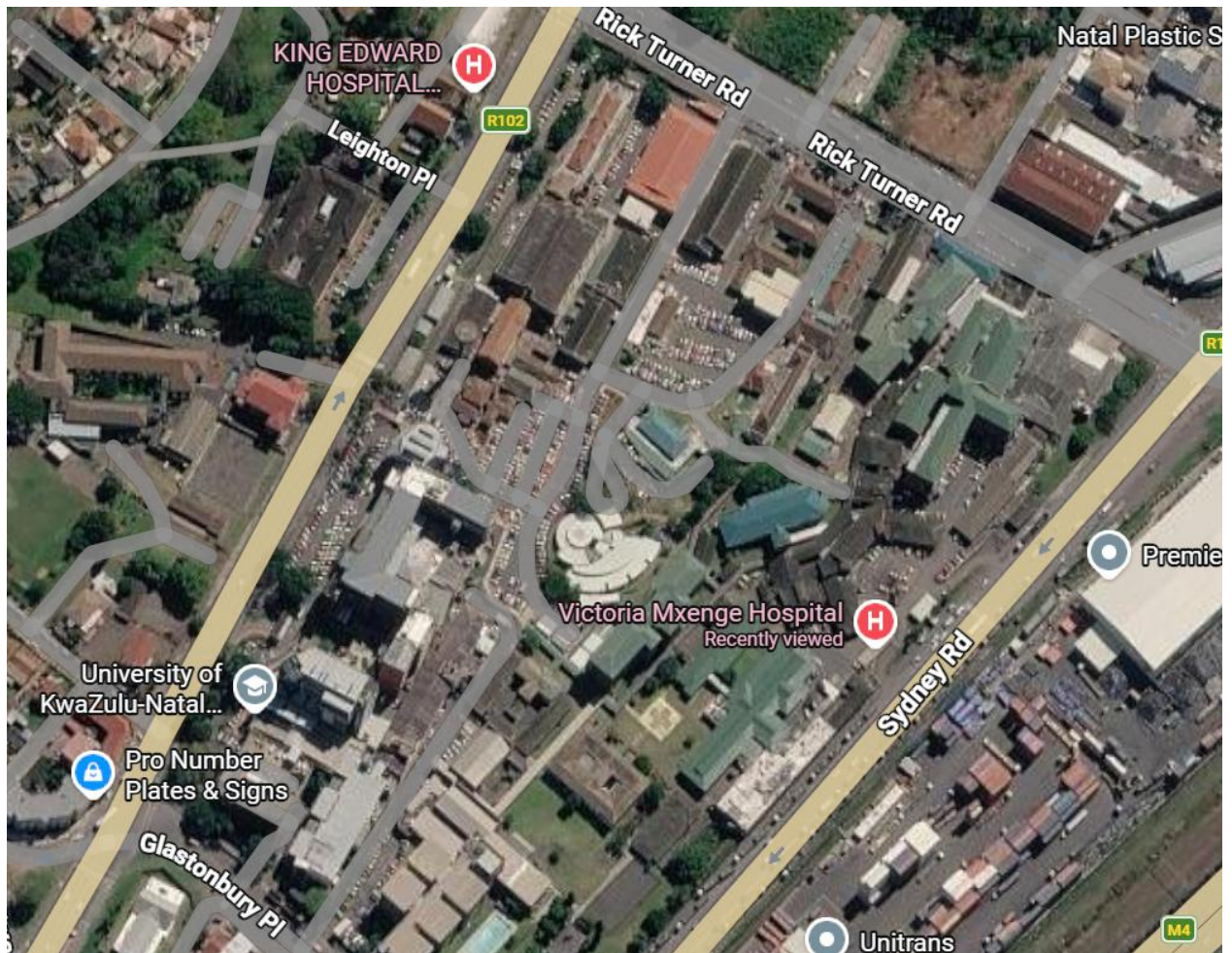
Figure 3: Victoria Mxenge Precinct